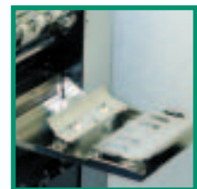
The Maifinisher 9000 can be easily detached from the printer for maintenance to be carried out