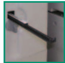
Automatic sealing roller cleaner. Cleaning pads prevent the build up of toner on the pressure seal rollers