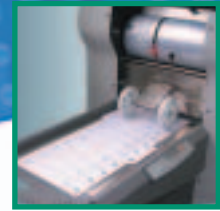
Automatic extending conveyor activated by the number of forms processed

Tel: +44(0) 1962 734433 Fax: +44(0) 1962 733366 E-mail: info@welltecsystemuk.co.uk Website: www.welltecsystemuk.co.uk